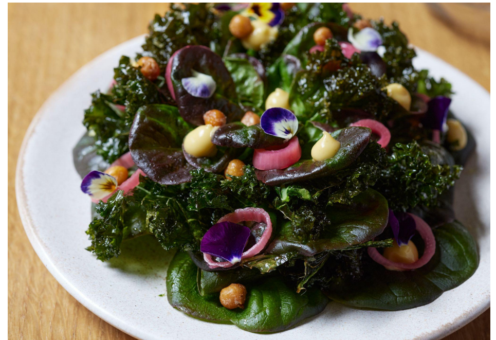
London red butterhead lettuce, Kultured miso aioli, Sussex tomatoes, crispy kale