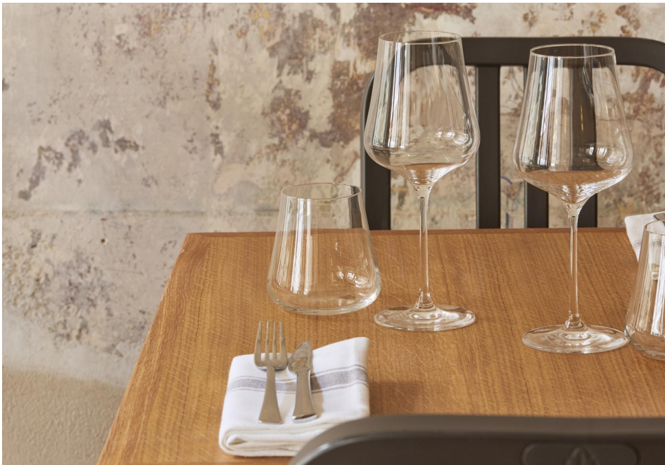
Image: Table setting

As we are a small restaurant, there are specific bookable times, to ensure all of our guests, and team, can have an enjoyable experience. Please get in touch and we'll check availability.