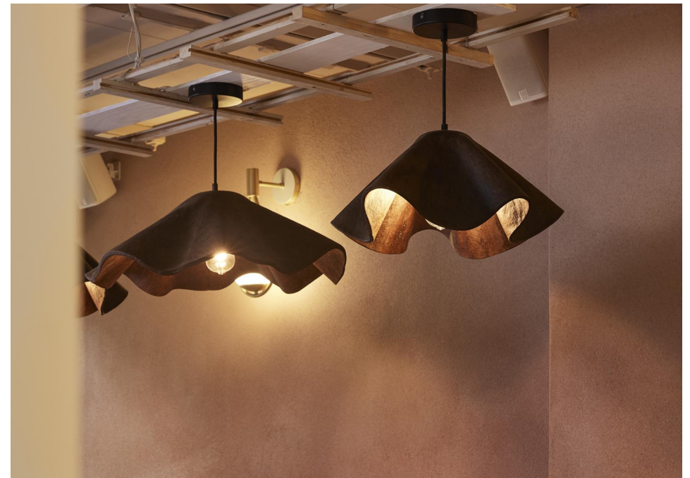
Biohm lampshades, over the Chefs' Table, made with coffee grounds

To ensure our team are rewarded for the work they do to ensure you have a wonderful experience with us, we suggest a discretionary 8% service charge on food and beverage spend.