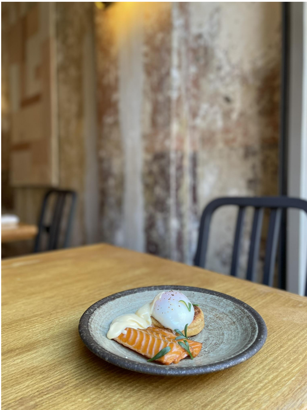
Images: Slow cooked eggs, smoked trout, hollandaise