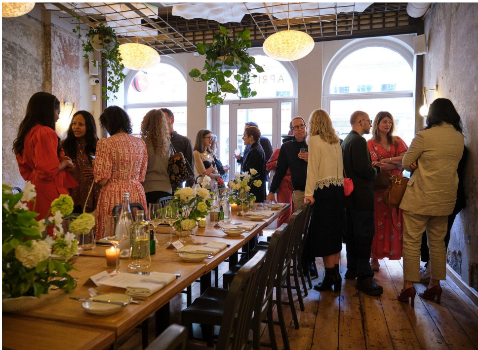
Images: Event setup